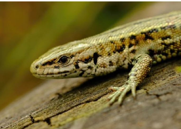
Common Lizard by Martin Minařík, Abbey Fields Photography Competition 2023

Some large, dramatically coloured moths entertained the 100 visitors to our Magical Moths and Beautiful Birds demo while seeing birds close-up enchanted many youngsters present.