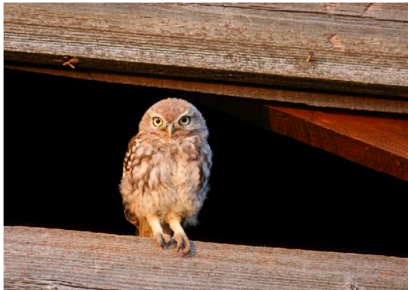
Little owl by Tony Neal, Abbey Fields Photography Competition 2023

Thirty people joined our Big Butterfly Counts. We had over 500 sightings, with 14 species at Long Meadow and 16 at CCSA. Unsurprisingly we have many more moths – 364 species at CCSA in two years.